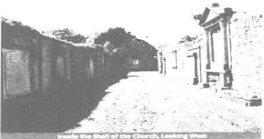
Inside the Shell of the Church, Looking West