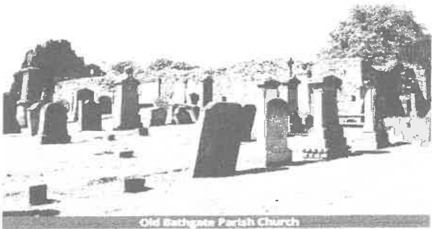
Old Bathgate Parish Church

I have been trawling through the internet looking for information and I thought that I would share with you some of the facts and I have no doubt suppositions that have come to light .